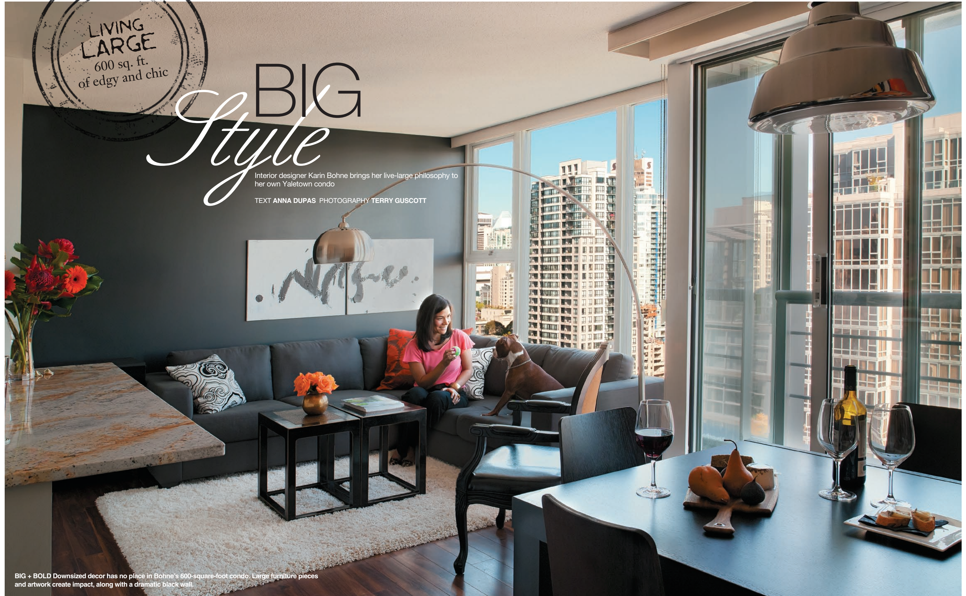
BIG + BOLD Downsized decor has no place in Bohne's 600-square-foot condo. Large furniture pieces and artwork create impact, along with a dramatic black wall.

TEXT ANNA DUPAS