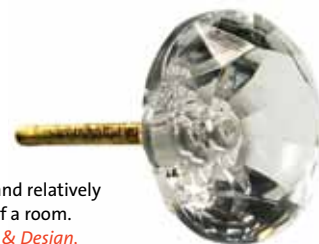
Changing hardware can be a simple and relatively inexpensive way to update the look of a room. Cut-glass drawer pull, The Cross Décor & Design, 1198 Homer Street, www.thecrossdesign.com