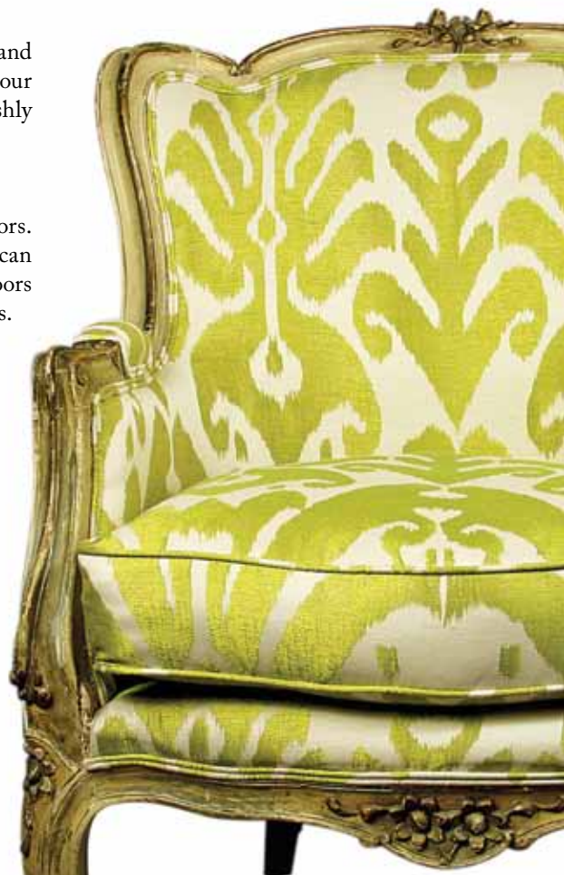
An ornate statement chair can serve as an accessory in the same way a piece of artwork might. Vintage Louis Chair, The Cross Décor and Design.