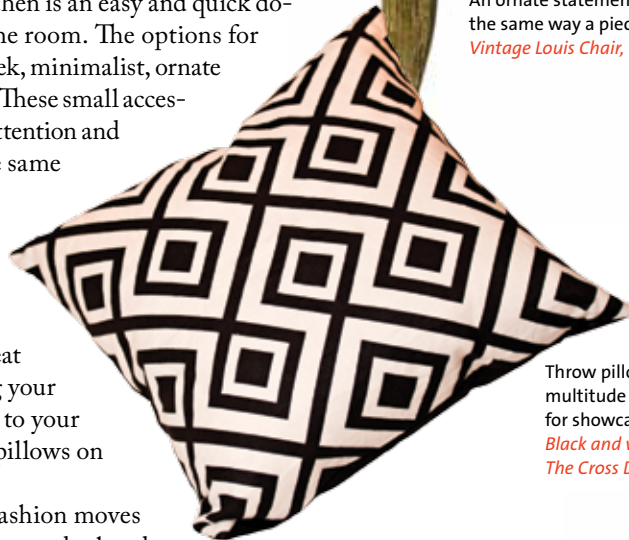
Throw pillows are now available in a multitude of materials and are perfect for showcasing trends. Black and white diamond throw pillow, The Cross Décor and Design.