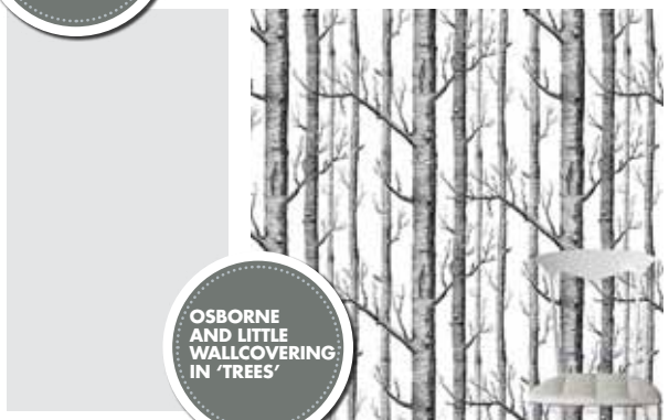
OSBORNE AND LITTLE WALLCOVERING IN 'TREES'