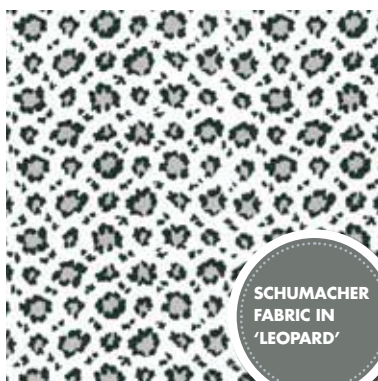
SCHUMACHER FABRIC IN 'LEOPARD'