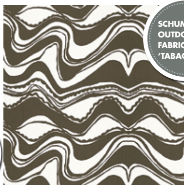
SCHUMACHER OUTDOOR FABRIC IN 'TABACCO'