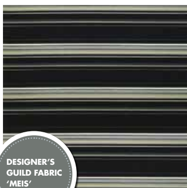
DESIGNER'S GUILD FABRIC IN 'MEIS'