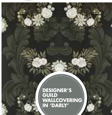
DESIGNER'S GUILD WALLCOVERING IN 'DARLY'

DRAMATIC WALLCOVERINGS AND FABRICS IN SHADES OF GREY